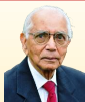
Prof. C. R. Rao