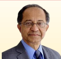
Prof. Kaushik Basu