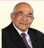
Dr. Y. V. Reddy