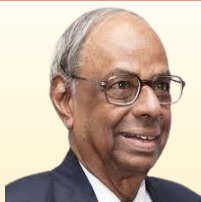
Prof. C. Rangarajan