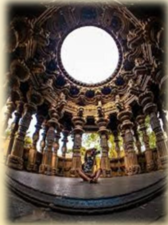
Kopeshwar Temple, Khidrapur