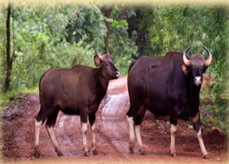
Dajipur Wildlife Sanctuary